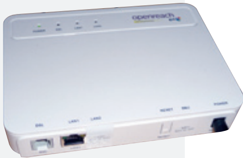
Openreach vDSL Modem