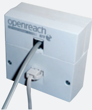
FTTC Openreach Socket Plate